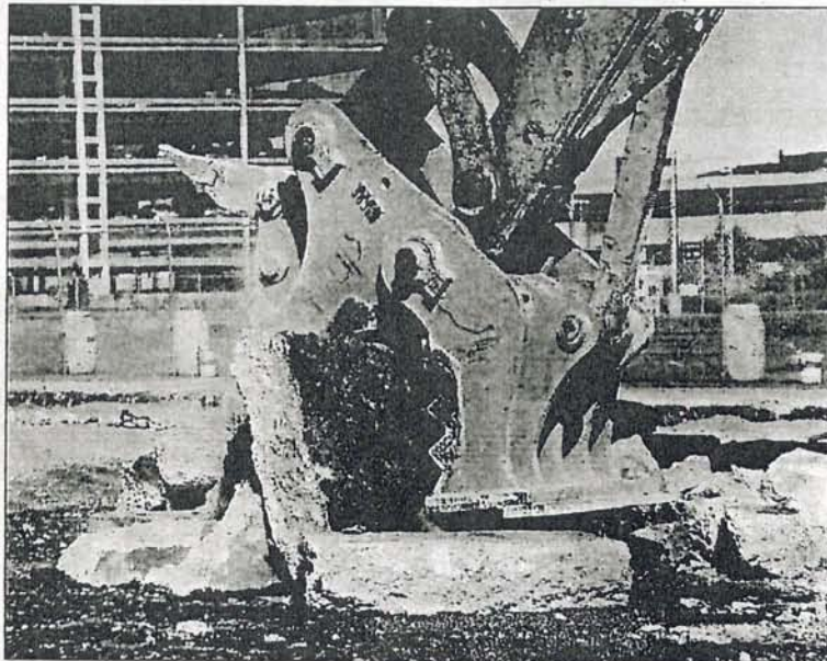
The Nye Series 7 digital concrete pulverizer crunches the 18-in. (45.7 cm) thick concrete at the Manchester airport, NH.