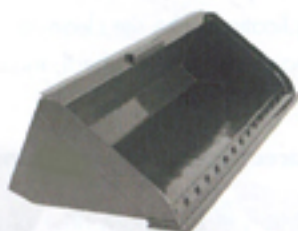
Heavy-Duty Utility Bucket with Bolt-On Edges